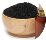
Black Cumin Seed Oil (Nigell Sativa)