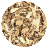
White Willow Bark - 15% Salicin