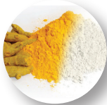
Curcumin C3 Reduct