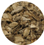
Devil's Claw (Grapple Plant)